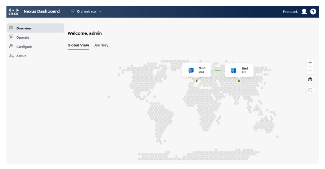
Figure 1. Cisco Nexus Dashboard Orchestrator

Functions like Operate contain fabrics and tenants operations, and Configure contains fabric to fabric connectivity and tenant configurations. The Admin category contains functions like System Configurations, Integrations, and so on. The functionality of each NDO GUI page is described in specific chapters later in this document.