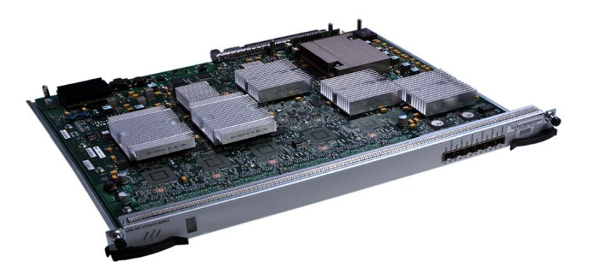
Figure 1. Cisco uBR-MC3GX60V-RPHY Broadband Processing Engine

There are 72 DOCSIS downstream and 60 upstream channels per card, so the Cisco uBR-MC3GX60V-RPHY BPE supports the same benchmark for scalable, fast, and cost-effective DOCSIS 3.0 Cable Modem Termination System (CMTS) solutions maintained by the Cisco uBR-MC3GX60V Broadband Processing Engine (BPE). With the new Cisco uBR-MC3GX60V-RPHY BPE, the Cisco uBR10012 platform scales up to 576 modular DOCSIS downstream channels and 480 upstream channels, (approximately 24 Gbps of downstream throughput and 14.4 Gbps of upstream throughput) in a single, carrier-class chassis as part of our Remote-PHY solution. On top of this, with the introduction of virtual combining, the bandwidth can be further scaled in the Ethernet domain to support more CMC hosted upstream channels and as many CMC downstream channels as required. The limit for downstream channels is based on the available bandwidth to be delivered to and from each CMC. This evolution moves the traditional RF combining of multiple service areas into CMTS ports to the Ethernet domain, allowing virtual combining to greatly enhance network scalability.