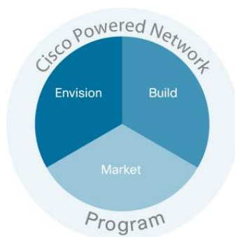
Figure 2. Cisco Powered Network Program