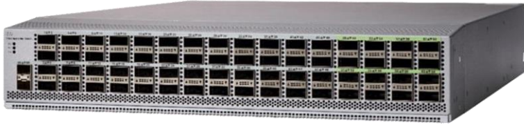
Figure 2. Cisco Nexus 9364C Switch

The Cisco Nexus 9332C is the smallest form-factor 1-Rack-Unit (1RU) spine switch for Cisco ACI that supports 6.4 Tbps of bandwidth and 2.3 bpps across 32 fixed 40/100G QSFP28 ports and 2 fixed 1/10G SFP+ ports (Figure 3). Breakout is not supported on ports 1 to 32. The last 8 ports marked in green support wire-rate MACsec encryption 2 .