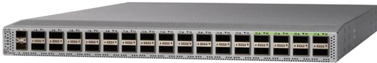
Figure 3. Cisco Nexus 9332C Switch

The Cisco Nexus 9332C is the smallest form-factor 1-Rack-Unit (1RU) spine switch for Cisco ACI that supports 6.4 Tbps of bandwidth and 2.3 bpps across 32 fixed 40/100G QSFP28 ports and 2 fixed 1/10G SFP+ ports (Figure 3). Breakout is not supported on ports 1 to 32. The last 8 ports marked in green support wire-rate MACsec encryption 2 .