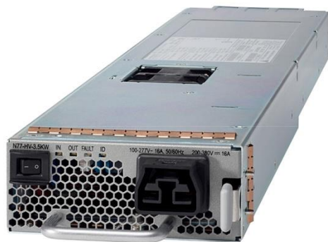
Figure 1. Cisco Nexus 7700 Platform 3.5-kW HVAC/HVDC Power Supply Module

The Cisco Nexus 7700 platform HV power supply modules are universal and versatile power supplies as a single module can support a wide range of AC and DC inputs (100 to 277 VAC and 200 to 380 VDC). Designed to address high-availability requirements, the power supplies provide multiple system-level redundancy options and incorporate internal component-level monitoring, temperature sensors, and intelligent remote-management capabilities. The power supply modules are fully hot swappable, helping ensure no system interruption during installation or upgrades, and they are accessible from the front for easy insertion and removal.