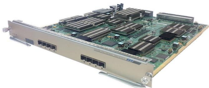
Figure 3. 6800 Series 8-Port 10-Gigabit Ethernet Fiber Module

The C6800 Family 8-port 10-Gigabit Ethernet Fiber module provides up to 40 10-Gigabit Ethernet fiber ports in a single Cisco Catalyst 6807-XL Switch chassis, or up to 80 10-Gigabit Ethernet fiber ports in a Cisco Catalyst 6807-XL Virtual Switching System (VSS) 2T. It also provides up to 88 10-Gigabit Ethernet fiber ports in a single Cisco Catalyst 6513-E Switch chassis or up to 176 10-Gigabit Ethernet fiber ports in a Cisco Catalyst 6500 Virtual Switching System (VSS) 2T.