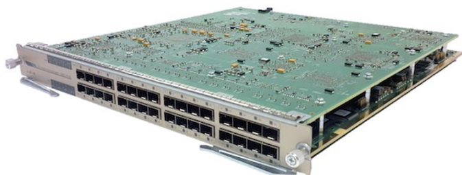
Figure 1. 6800 Series 32-Port 10-Gigabit Ethernet Fiber Module.

The C6800 Family 32-port 10-Gigabit Ethernet Fiber module provides up to 160 10-Gigabit Ethernet fiber ports in a single Cisco Catalyst 6807-XL Switch chassis or up to 320 10-Gigabit Ethernet fiber ports in a Cisco Catalyst 6807-XL Virtual Switching System (VSS) 2T. It also provides up to 352 10-Gigabit Ethernet fiber ports in a single Cisco Catalyst 6513-E Switch chassis, or up to 704 10-Gigabit Ethernet fiber ports in a Cisco Catalyst 6500 VSS 2T.