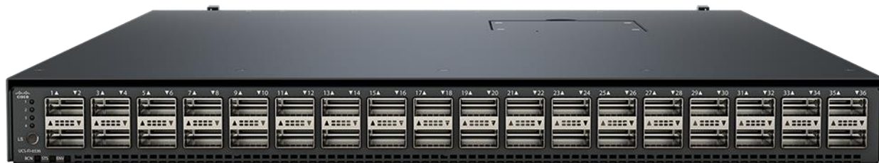
Figure 2. Cisco UCS 6536 Fabric Interconnect

From a networking perspective, the Cisco UCS 6536 uses a cut-through architecture, supporting deterministic, low-latency, line-rate 10/25/40/100 Gigabit Ethernet ports, a switching capacity of 7.42 Tbps per FI and 14.84 Tbps per unified fabric domain, independent of packet size and enabled services. It enables 1600Gbps bandwidth per X9508 chassis with X9108-IFM-100G in addition to enabling end-to-end 100G ethernet and 200G aggregate bandwidth per X210c compute node. With the X9108-IFM-25G and the IOM 2408, it enables 400Gbps bandwidth per chassis per FI domain. The product family supports Cisco® low-latency, lossless 10/25/40/100 Gigabit Ethernet unified network fabric capabilities, which increases the reliability, efficiency, and scalability of Ethernet networks. The 6536 Fabric Interconnect supports multiple traffic classes over a lossless Ethernet fabric from the server through the fabric interconnect. Significant TCO savings come from the Unified Fabric optimized server design in which Network Interface Cards (NICs), Host Bus Adapters (HBAs), cables, and switches can be consolidated.