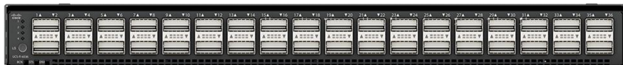
Figure 4. Cisco UCS 6536 (1RU) Fabric Interconnect