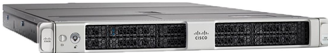
Figure 1. Cisco Secure Network Server

Figure 1 shows the Cisco Secure Network Server.