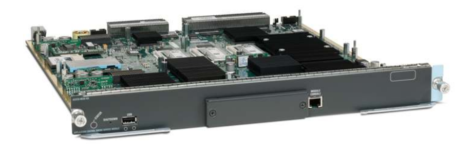
Figure 1. Cisco ACE Module for Cisco Catalyst 6500 Series Switches and Cisco 7600 Series Routers

By combining high-performance application delivery with a comprehensive set of state-of-the-art application delivery features, the Cisco ACE Module enhances IT efficiency and reduces the total cost of ownership (TCO). IT efficiency is increased through the use of innovative features such as virtual devices, role-based administration, instant application isolation, and single-view provisioning. Improved TCO is accomplished by consolidating most Layer 4 through 7 requirements into a complete and reliable application delivery platform.