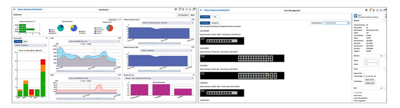
Figure 2. Monitoring dashboard and Front panel view