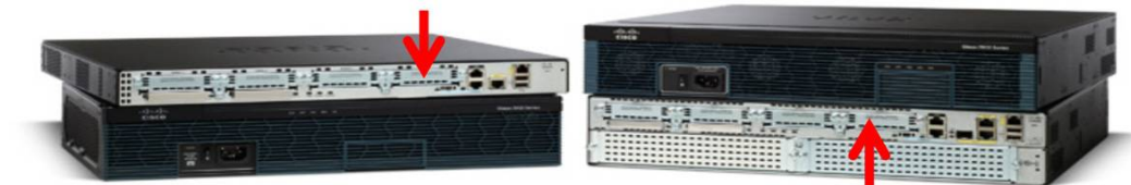
Figure 1. LTE eHWIC