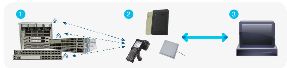
Figure 1. How an RFID system works