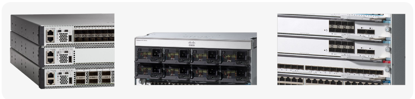
Figure 4. RFID tags

The Cisco Catalyst 9200, 9300 and 9500 Series, which are one-rack-unit (1RU) switches, have one built-in RFID tag in the front panel of the switch. The modular Cisco Catalyst 9400 and 9600 Series chassis features built-in RFID on several system components: the supervisor, line card, and fan tray. The RFID tag on the Cisco Catalyst 9400 and 9600 Series line cards are embedded in the ejector arm handle (Figure 4).